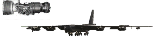
B-52 / TF33-P103