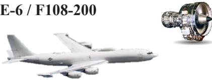
E-6 / F108-200