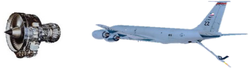
KC-135 / F108-100