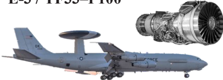
E-3 / TF33-P100