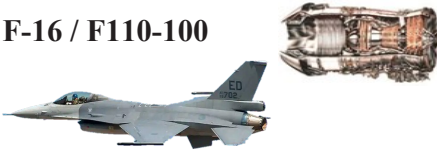
F-16 / F110-100